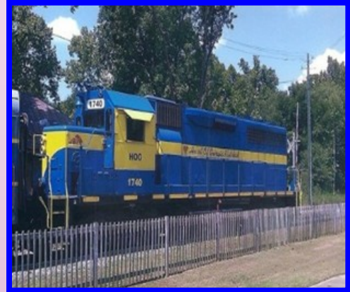
SAM Shortline Express

All Aboard! Join the Media Committee for a tour of the Civil Rights Museum in Albany, Georgia and a ride on the historic SAM Shortline Excursion Train (Watermelon Express) departing from Cordele, GA (Watermelon Capital of the World). Members and Friends of CFBC are welcomed.