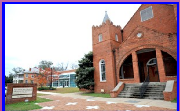
Albany Civil Rights Institute